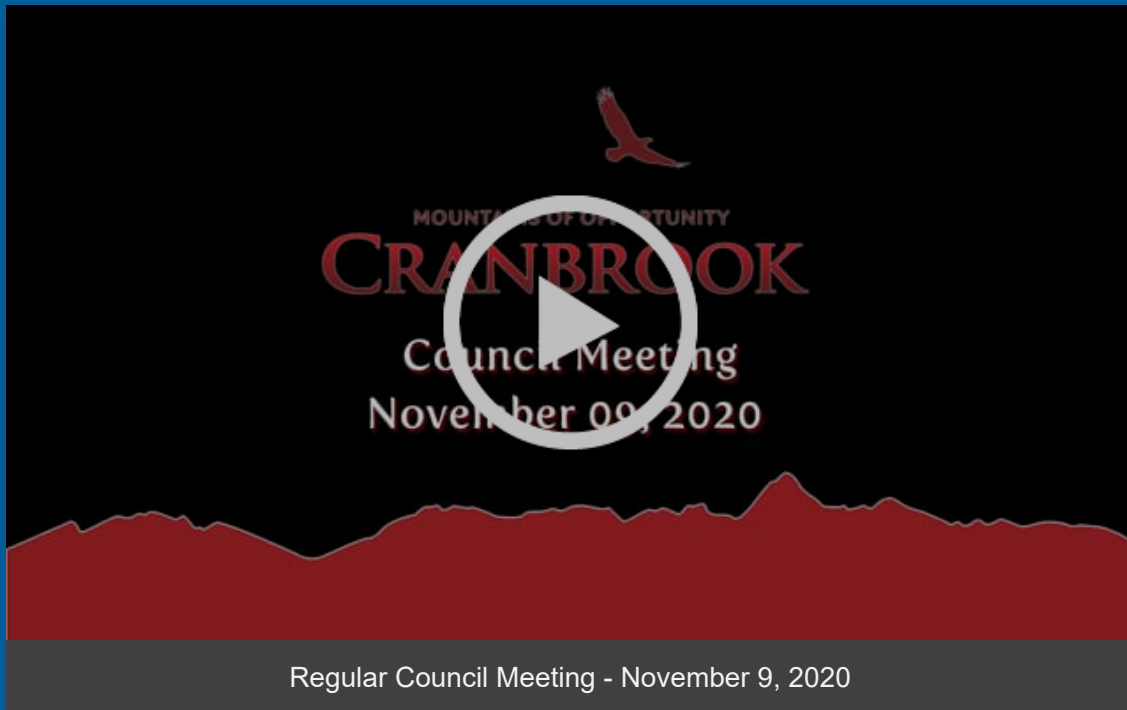
Regular Council Meeting - November 9, 2020

The meetings will be live streamed. The public is encouraged attend at www.cranbrook.ca/livestream , and submit comments in writing prior to 4pm on Monday, November 23, 2020 by email at info@cranbrook.ca or by dropping off your comments at City Hall.