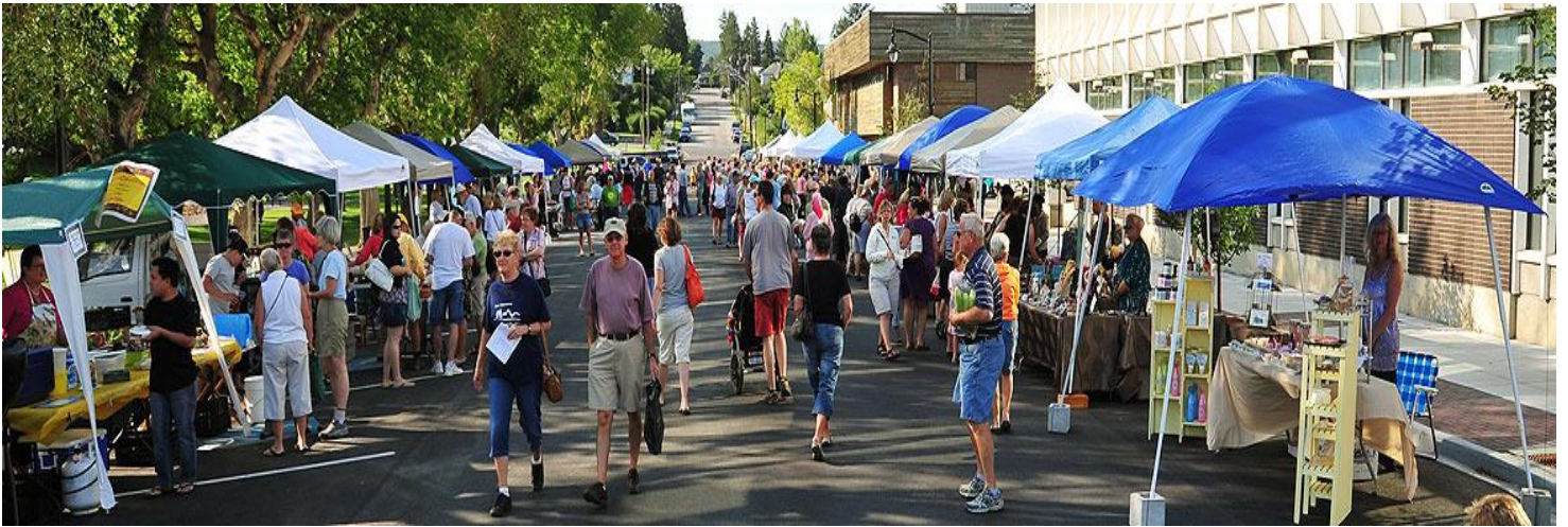
Downtown Farmers' Market