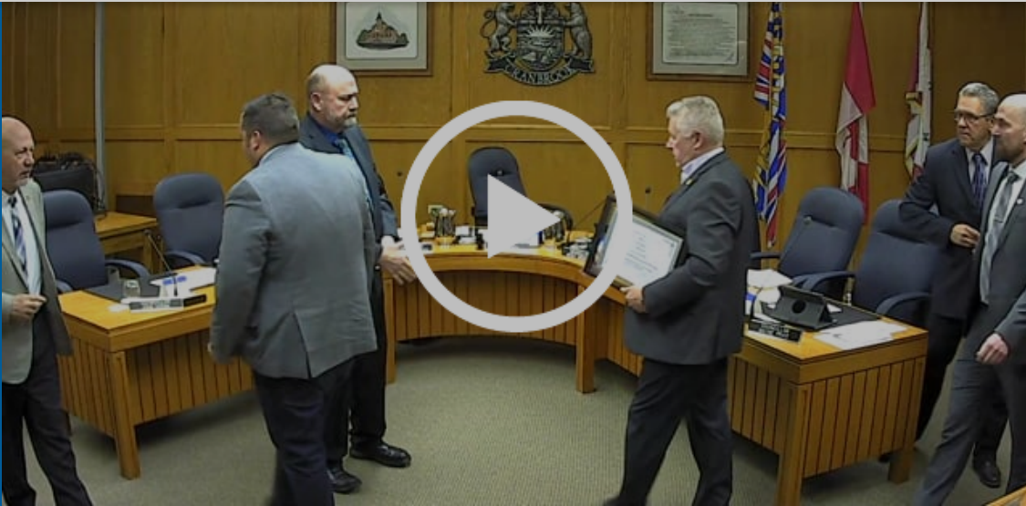
Regular Council Meeting - Monday January 6, 2020