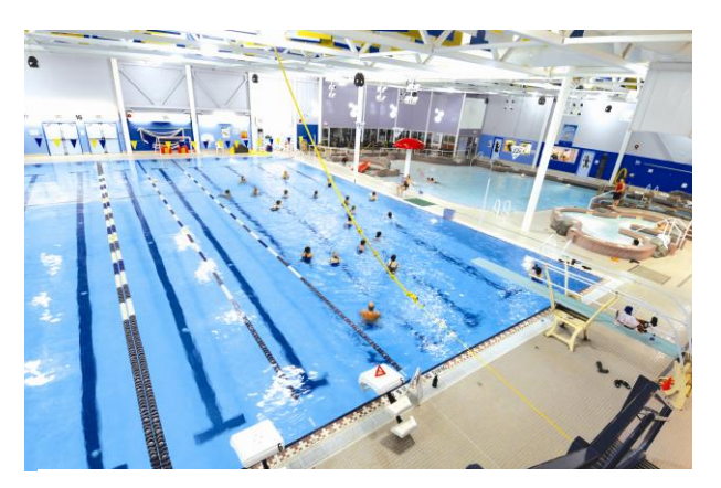
Cranbrook Aquatic Centre

City of Cranbrook Community Services Department