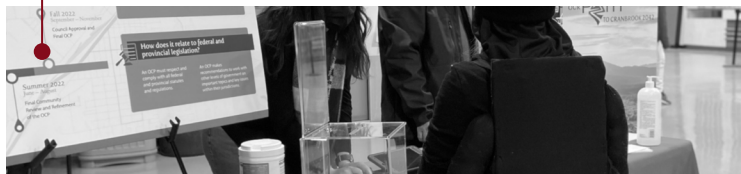
Engagement on community visioning