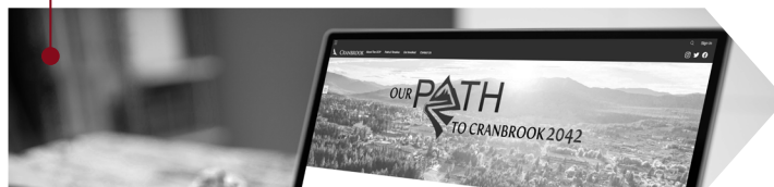
Final public review of the Official Community Plan