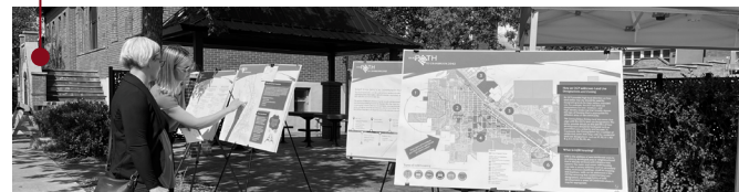
Engagement on potential land use concepts & policies