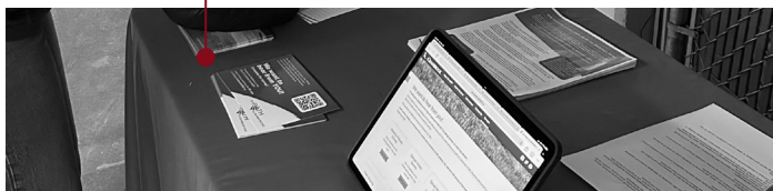
Engagement on the draft Official Community Plan